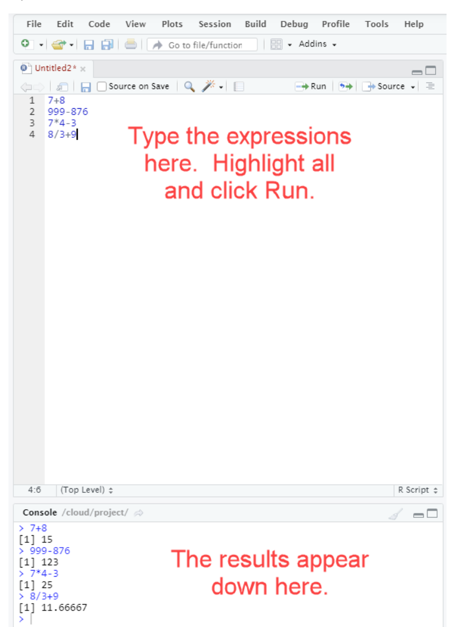
Clearly, R can handle simple math and knows Order of Operations. What about more advanced calculations?